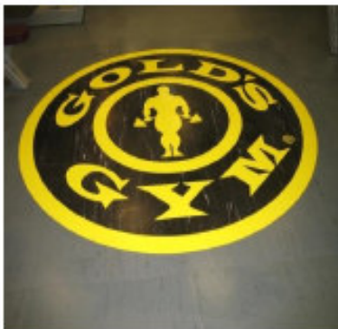
Custom logo cutting available